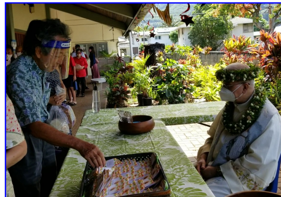
Happy Father's Day