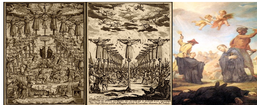
St. Pedro Bautista, OFM - the First Martyr of Japan, (left) and Augustinian Martyrs of Japan. (right)

Mission Statement: "Pascendi Dominici Gregis!"