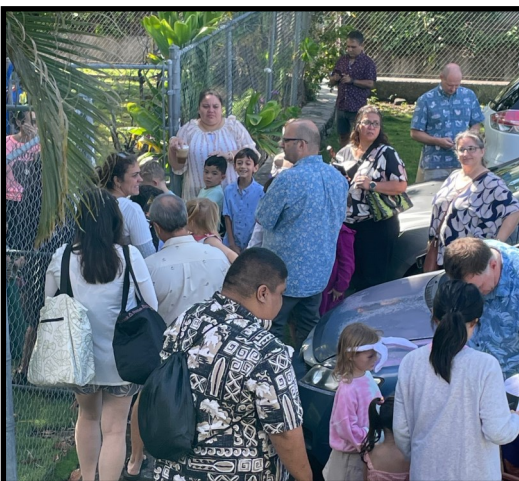
Easter Egg Hunt Anticipation